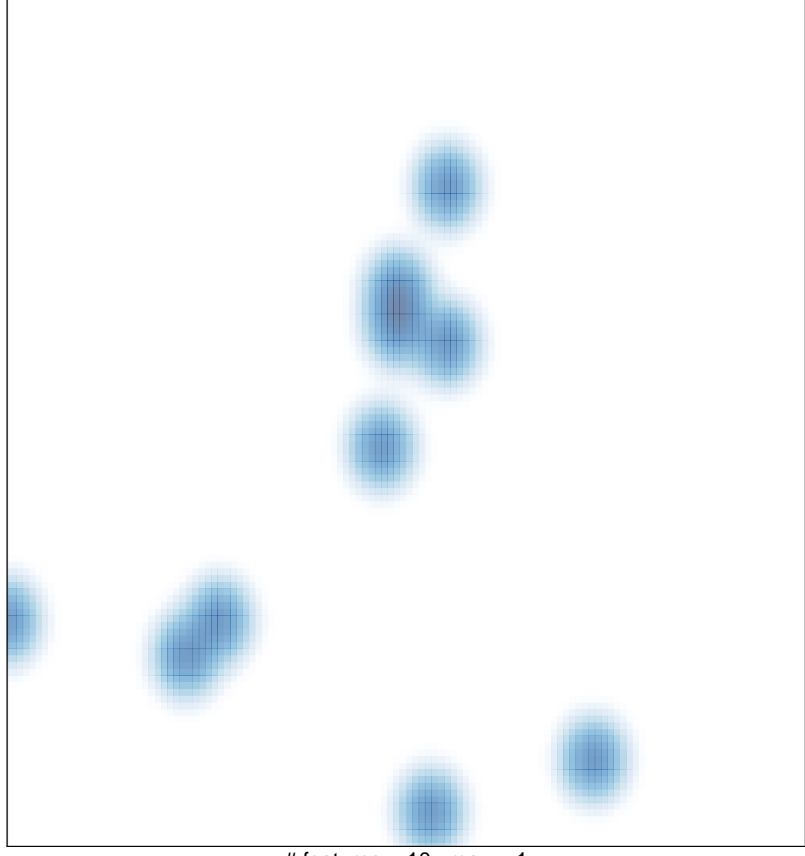
# features = 10, max = 1